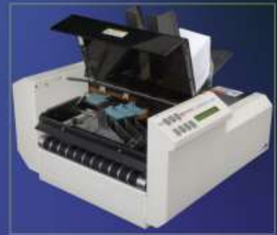
Five HP 45 cartridges provide 2.5" of printing area

Specifications are subject to change without notice.