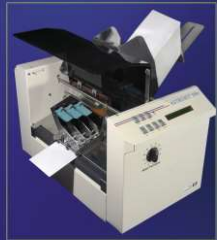
AJ 300P - Single speed printer AJ 500P - Multiple speed printer Small, economical and efficient.