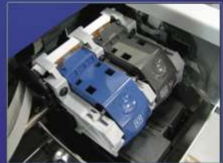
Hewlett-Packard® ink cartridges for high quality, economical printing