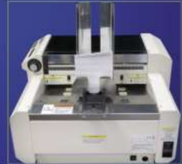
Built-in friction feeder for continuous runs.