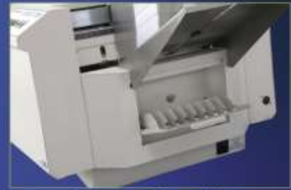
Convenient Ink cartridge storage compartment

Specifications are subject to change without notice.