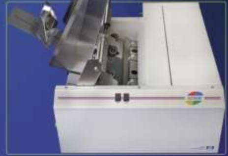
Stainless Steel construction

Specifications are subject to change without notice.