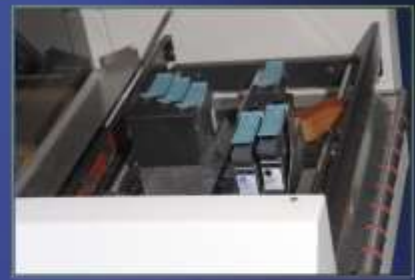
Uses reliable HP45 Cartridge

Specifications are subject to change without notice.