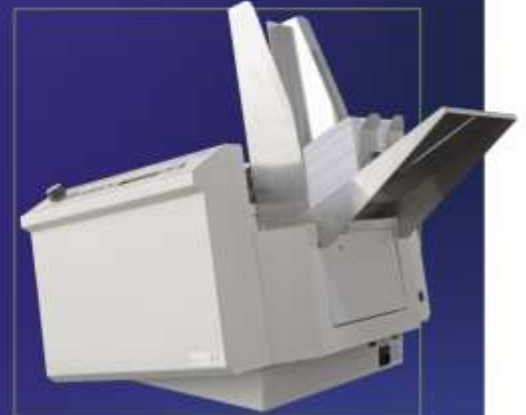
Stainless Steel construction guarantees reliability and durability.