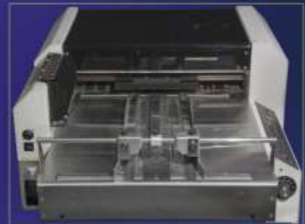
Solid steel construction, belt and vacuum powered conveyor for reliable media transport