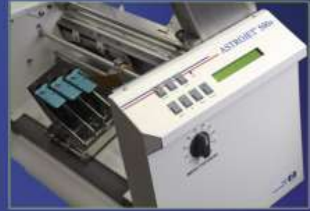
Three HP 45 Ink cartridges deliver 1.5" of printing area for quality addressing.

Specifications are subject to change without notice.