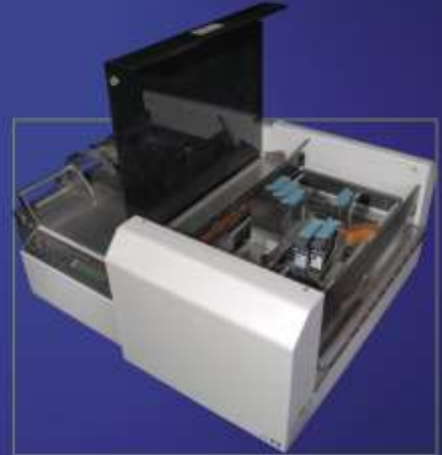
It comes with 6 (AJ 3600P) or 8 (AJ 3800P) printheads installed