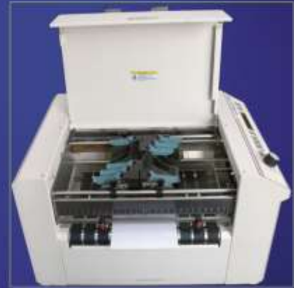
Eight HP 45 cartridges deliver high quality printing at blazing speed