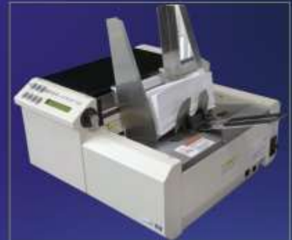
Stainless steel construction